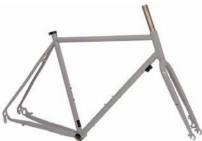
F10 STEEL FRAME + FORK code F10RSD Disc Size: 510|540|570|600|630 mm MSRP: 649,00 €