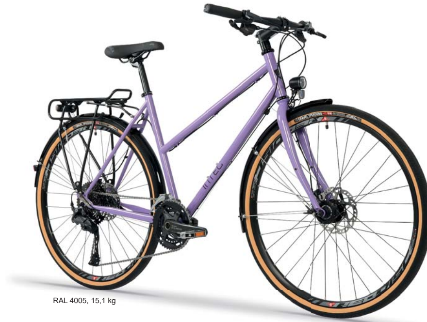
RAL 4005, 15,1 kg

SHIMANO Alfine 8s, black code T010A8SWD MSRP: 2.099,00 €