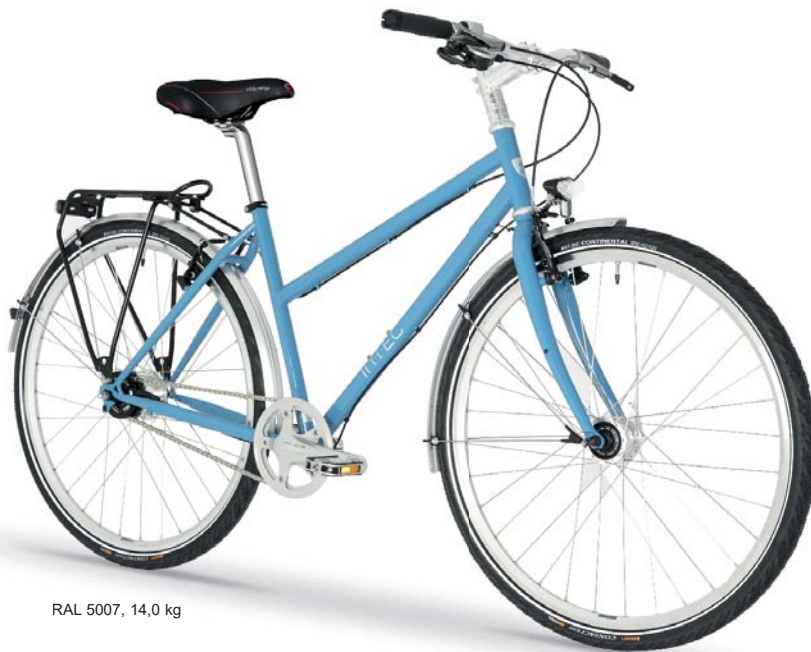
RAL 5007, 14,0 kg