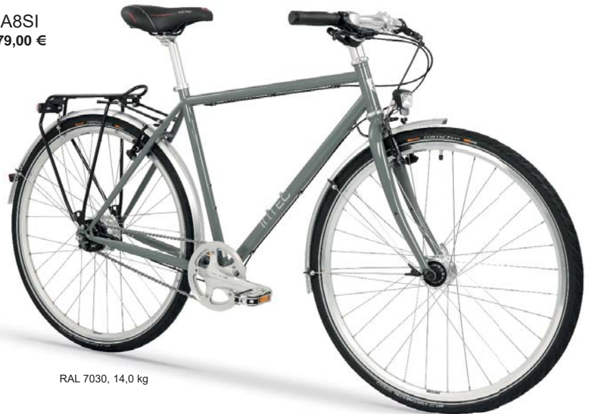
RAL 7030, 14,0 kg