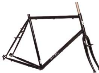
T6 STEEL FRAME + FORK Cantilever only Size: 490|530|570|610|645 mm code T616+ MSRP: 569,00 €