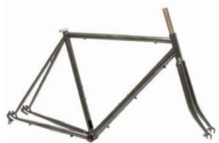
F5 STEEL FRAME + FORK Size: 520|550|580 mm code F5RS MSRP: 599,00 €