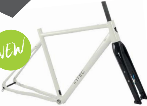
GX3 ALU GRAVEL FRAME 28" incl. fork | Disc Only Size: XS | S | M | L | XL code GX3RS MSRP: 649,00 €