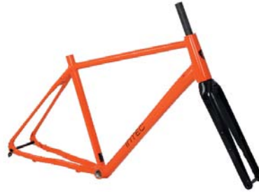
GX2 ALU GRAVEL FRAME 28" incl. fork | Disc Only Size: XS | S | M | L | XL code GX2RS MSRP: 549,00 €