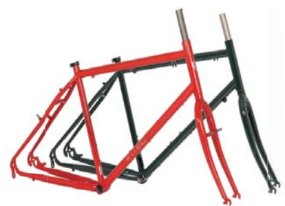
M1 STEEL FRAME + FORK Size: 420|460|500|540|580 mm code M1RSC Cantilever code M1RSD Disc MSRP: 539,00 €