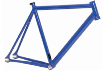
P1 ALLOY FRAME Size: 420 | 490 | 530 | 570 | 610 mm code P1RS MSRP: 299,00 €