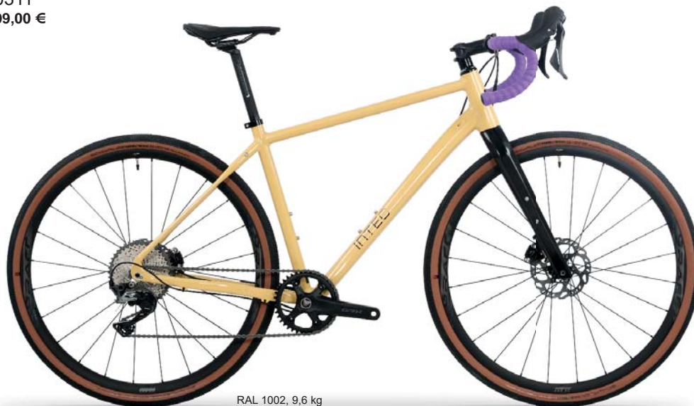
RAL 1002, 9,6 kg