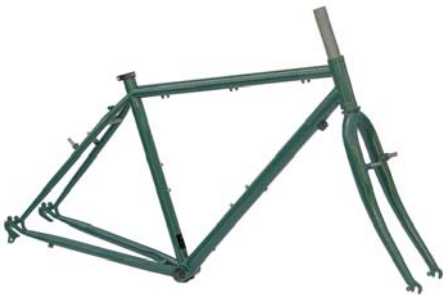
T6 STEEL FRAME + FORK Cantilever only Size: 490|530|570|610|645 mm code T6RSC MSRP: 569,00 €