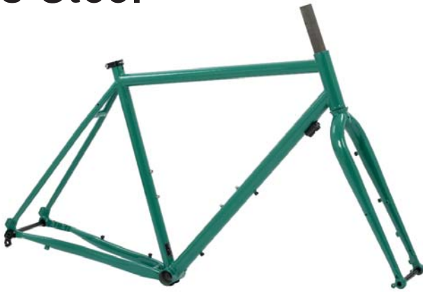
F11 Steiger STAHL STEEL FRAME 28" + FORK Disc only Size: 480|510|540|570|600|630 mm code F11RS MSRP: 999,00 €