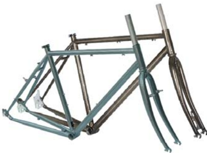
T9 STEEL FRAME + FORK Cantilever only, for ROHLOFF drive Size: 530|570|610 mm code T9RSC Cantilever code T9RSD Disc MSRP: 839,00 €