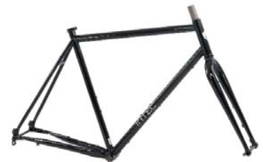
F11 Steiger STEEL FRAME 28" + FORK | Disc only Size: 480|510|540|570|600|630 mm code F1116+ MSRP: 999,00 €