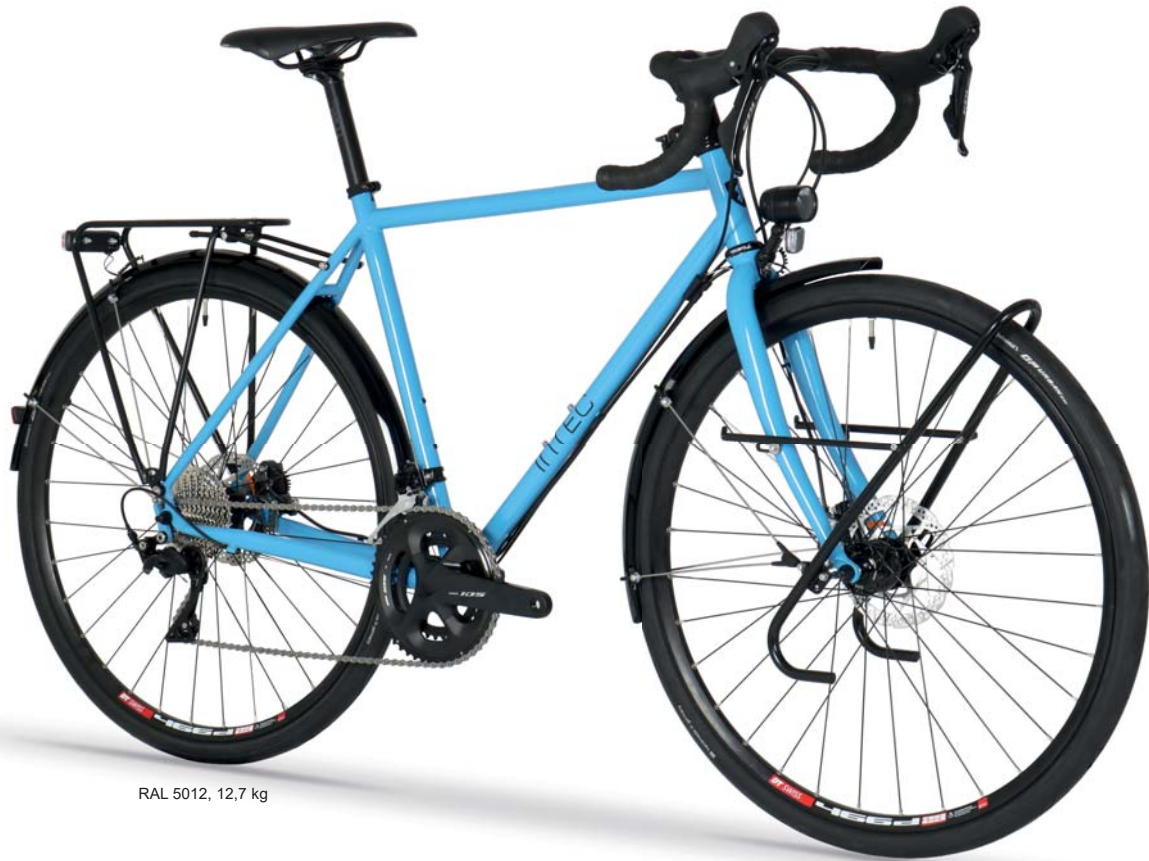
RAL 5012, 12,7 kg