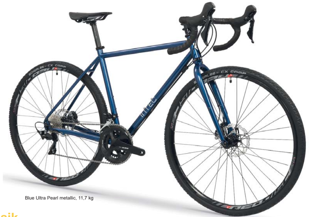
Blue Ultra Pearl metallic, 11,7 kg