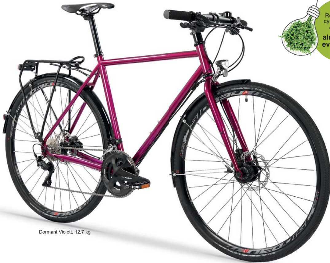
Dormant Violett, 12,7 kg