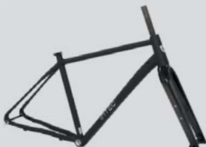
GX2 ALU GRAVEL FRAME 28" incl. fork | Disc Only Size: XS | S | M | L | XL code GX2RS MSRP: 549,00 €